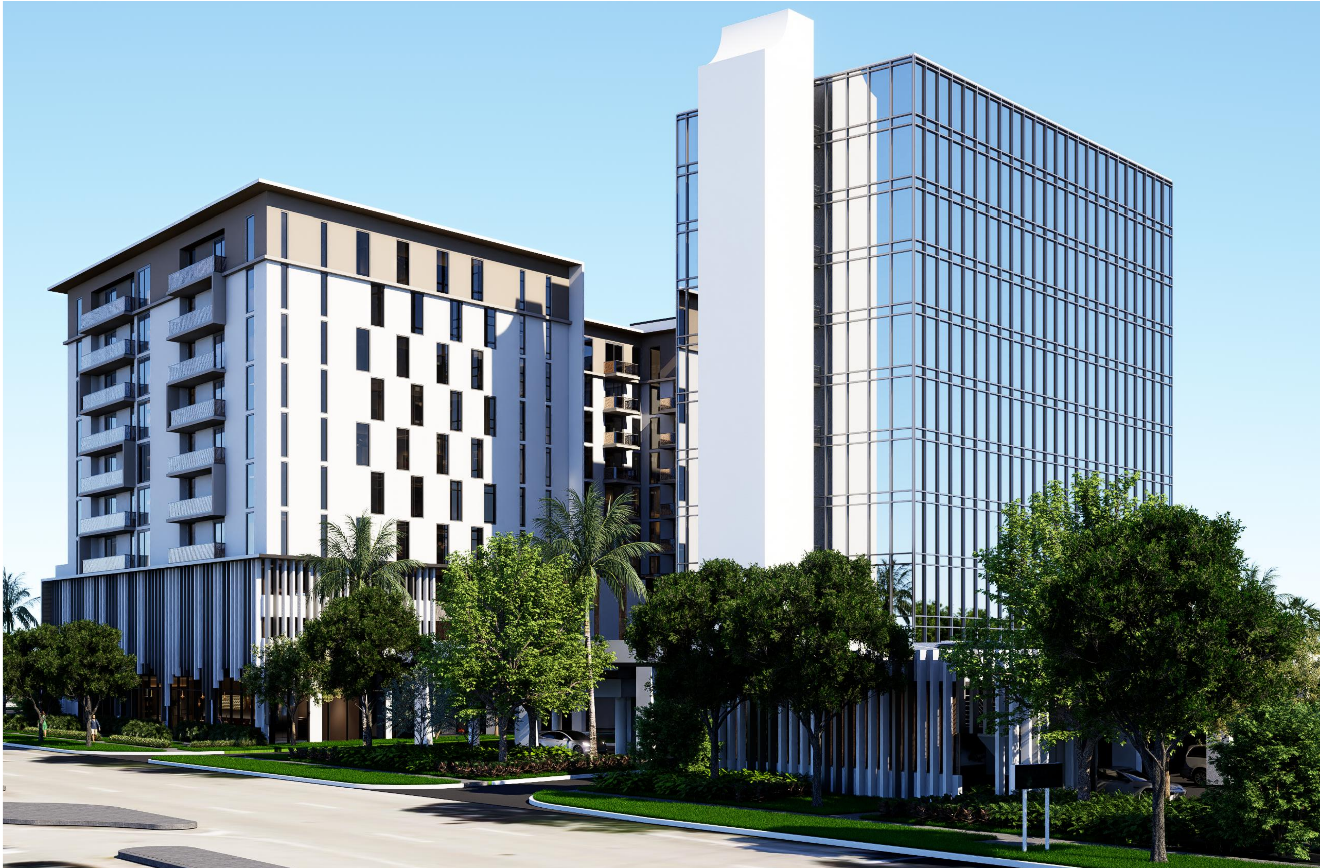
FIRE TRUCK ENTRANCE ON FEDERAL HIGHWAY